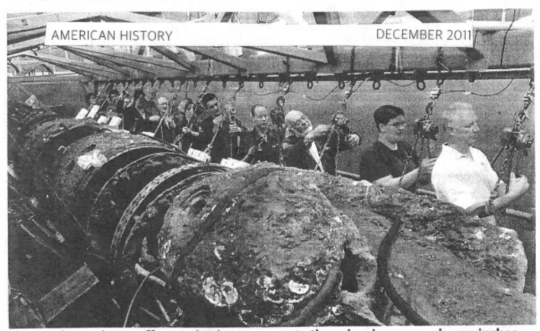
H.L. Hunley project staffers and volunteers rotate the sub using come-along winches.