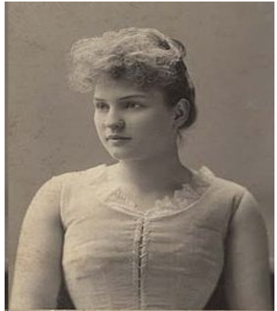
Marie Bankhead Owen (September 1, 1869 – March 1, 1958)

The truth of the matter is that slavery existed in New England for more than 200 years (beginning in 1638) and it was every bit as degrading and dehumanizing as slavery anywhere. In mid eighteenth century Rhode Island slaves accounted for as much as one third of the population in many communities. Newport, Rhode Island, and Boston, Massachusetts, were the two biggest hubs of the transatlantic slave trade. Many slaves worked in the shipping industry in New England. Connecticut, Massachusetts, and Rhode Island were the three biggest Northern slave-owning states.