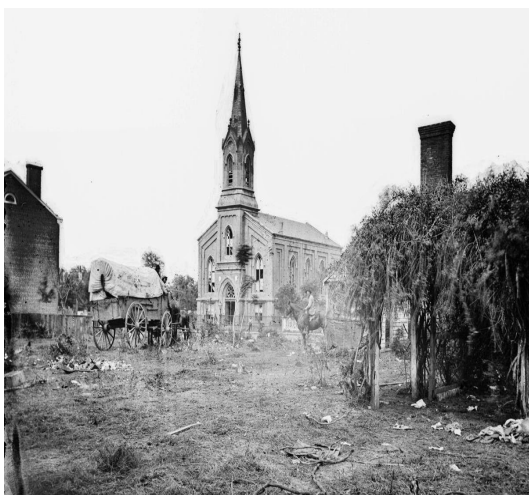
The Baptist Church in Fredericksburg, Virginia on May 20, 1864, after the city was damaged in two different major battles.

Modern historians would have us believe Lincoln invaded the South to free the slaves. Lincoln's unnecessary invasion of the South cost 750,000 soldier's lives, 70,000 southern women and children's lives, and more than 1,000,000 slave's lives. Lincoln freed the slaves right into disease and starvation. Modern historians would have us believe Lincoln invaded the South to free a race of people that he thoroughly despised. Only a true flag hater, or the habitual liar would promote such garbage. "Colonization After Emancipation" is a most useful corrective to Lincoln myths and legends. It is about time.